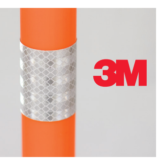
360 Degree Visibility