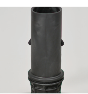
Quick Connect Tabs