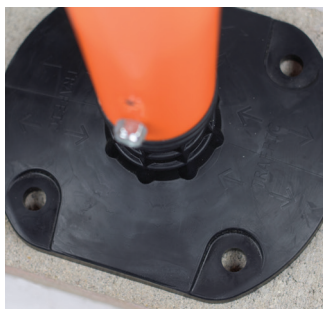
Permanent Mount Base